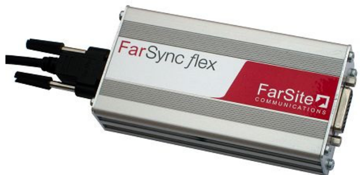
USB Adapter for BERT line testing and Line Monitoring